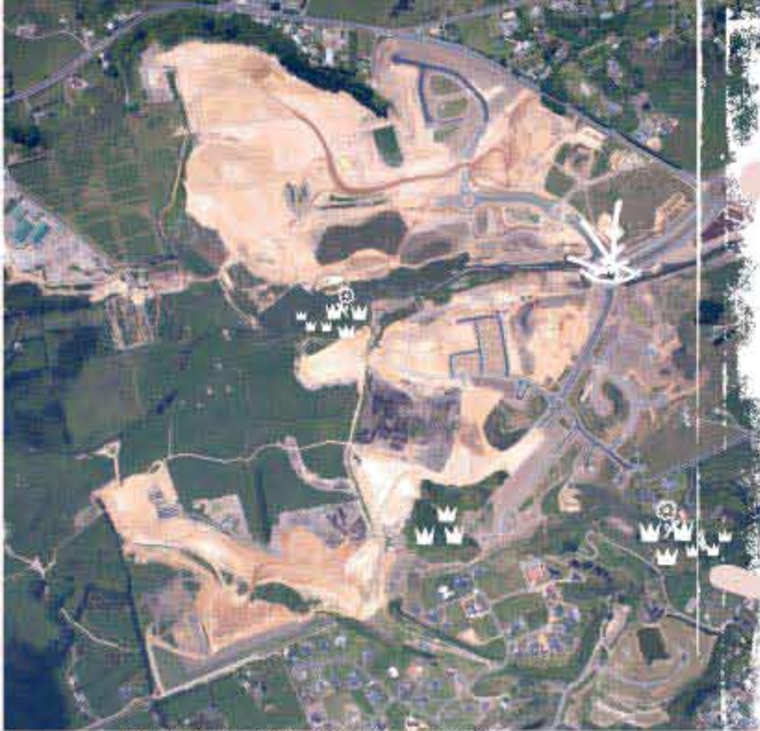
The Lakes Stage One Construction Development March 2006

impacts and encourage people to become more physically active. This also provides informal opportunities for social and cultural interaction.